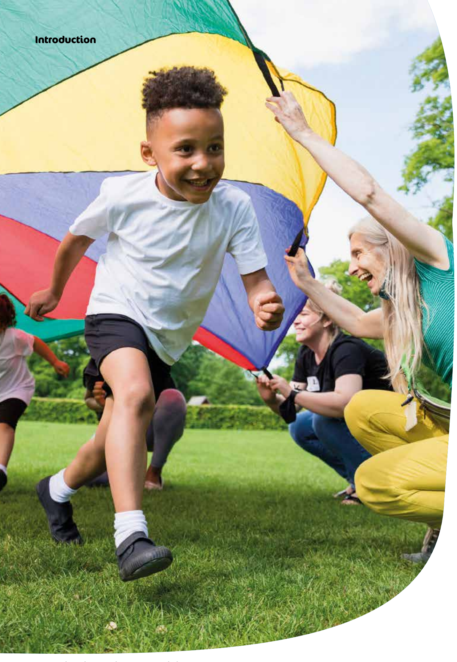
4 Ordinarily available provision (schools)